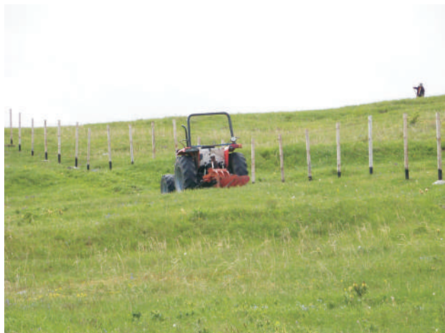
Fenced site for forest restoration in Northern Armenia

The restoration activities included fencing (to protect the restoration area from livestock), planting, seeding and promoting natural regeneration. Only native tree species (from local provenances), such as oak, beech, ash, maple, chestnut and wild apple were used. In addition to forest restoration, activities such as building capacity of forestry nurseries, training and awareness-raising activities were implemented. Innovative planting and seeding methods as well as tools were used to increase the efficiency and effec-