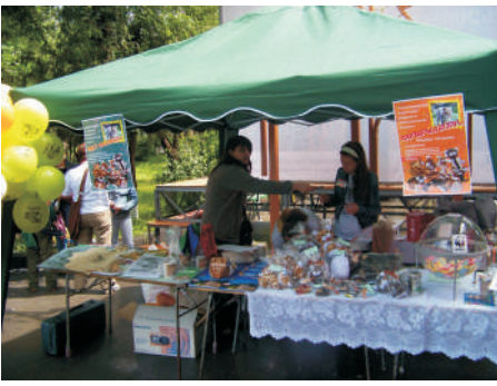
WWF volunteers helping to raise funds by selling WWF-branded stuff in the Zoo

To note “Save the Caucasian Leopard in Armenia” campaign is being implemented in the frames of “Biodiversity Protection and Community Development: Implementing Ecoregional Conservation Plan Targets in South Armenia” project funded by the Ministry of Foreign Affairs of Norway. The project focuses on biodiversity protection and community development in southern Armenia by following up Ecoregional Conservation Plan recommendations for enlargement of protected area coverage. Significant attention is being paid to the involvement of stakeholders and local communities in the operation of the existing protected areas in Armenia.