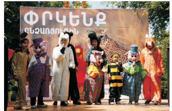
'Leopard - King of Animals' performed by children