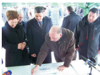
WWF Armenia Director shows the Prime Minister (on his right) the boundaries of the newly established Arpi Lake NP

March 16, 2010 - Prime Minister of Armenia, Tigran Sargsyan visited the project site in Shirak region to see the ongoing activities of 'Establishment of Protected Areas in Armenia's Javakhq (Ashotsk) Region' project implemented by WWF Armenia in close collaboration with the Ministry of