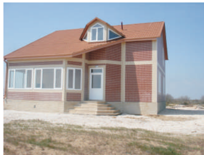
Guest House in Shirvan National Park in Azerbaijan

With support of CEPF and WWF Caucasus PO ecotourism infrastructure is being developed in Shirvan National Park. Presently, the tangible result is on the ground – completed guest-house as a main base for further development tourism. GTZ also plans to allocate additional funding to provide a renewable energy system based on photo voltaic and wind energy to this guest-house. Additionally, the tourism management plan is under development through the financial support of MAVA Foundation.