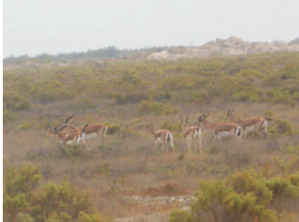
Shirvan National Park in Azerbaijan

Azerbaijan's system of Protected Areas has a long history of development and takes beginning from the twenties of 20 th century. National parks are relatively new category for Azerbaijan. The Ministry of Ecology and Natural Resources has started establishment of National Parks since 2003 and during the last five years 8 national parks (with total area of 295 921 ha) have been established. Shirvan National Park (Shirvan NP) is one of the most attractive tourist destinations in Azerbaijan.