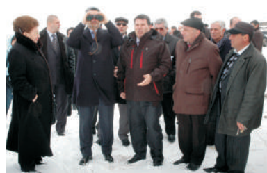
Prime Minister, Tigran Sargsyan explores Arpi Lake NP

The prime minister attached great importance to successful implementation of this project as in his words: "the project has not only an ecological importance but also socio-economic as the establishment of Arpi Lake National Park in the long run, contribute to overall development of communities and harmonious cooperation among them."