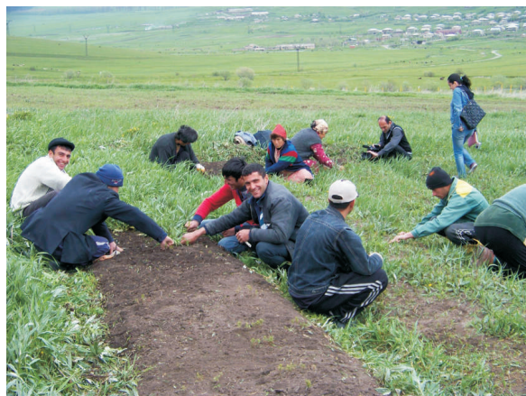
Nursery where the seedlings are taken care of

The project has come to its conclusive stage and has already yielded considerable outcomes. Specifically, around 1,350 hectares of forests have been restored by various methods in all three countries. Restoration sites were selected by the following criteria: