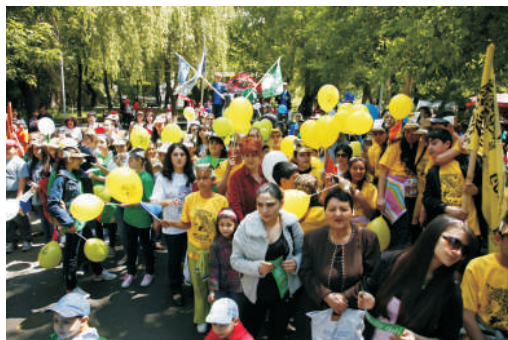
Participants of the event

Pupils from seven schools of Yerevan participated in handworks' contest-exhibition. Through the hand-made artifacts such as carpets, drawings, placards, puppets as well as poems children tried to convey their message to adults that 'leopard is in danger and poaching should be stopped.'